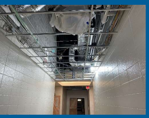
Ceiling Grid Installed in Areas B,C Hallways