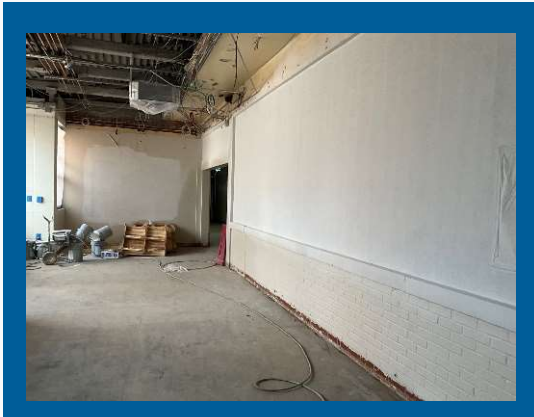
Hallway Murals Prepped And Primed