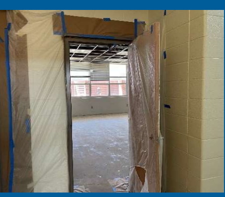
Door Frames 1<sup>st</sup> coat of Finish Paint