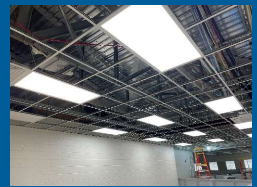
Lights Set in Gym Ceiling Grid