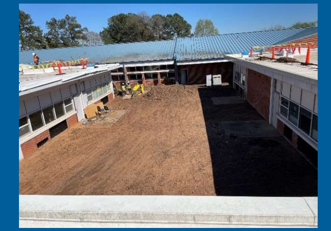
Grading and Clearing at Courtyard