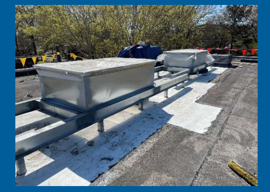
HVAC Rooftop Curbs Set at Cafeteria