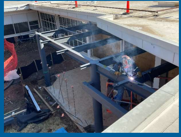
Vestibule Structural Steel Installed